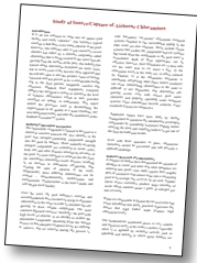
White Paper (Downloadable)

The Paddock microsite serves as the central portal of all marketing communications. It functions as a media audit, measuring response from various media. We offered a downloadable white paper as an incentive to drive people to the microsite. There we collected additional information from visitors to be used in future marketing initiatives.